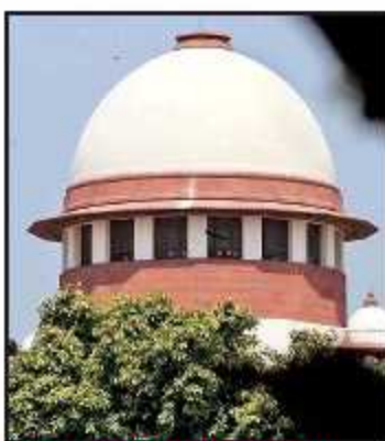
LEGAL FIGHT OVER FAITH

New Delhi: In a strategic move to dilute the joint suit filed by deity Ram Lalla and 'Ram Janmasthan' claiming ownership over the disputed 2.77 acre Ayodhya land, Muslim parties on Friday raised doubts over the legitimacy of 'Ram Janmasthan' as a juristic person by asking whether Hindus believed it to be an incarnation of God.