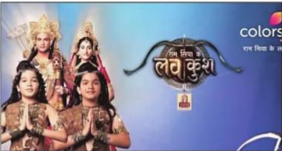
The notice was issued on September 11.

The notice also stated that "it has been further observed that in this serial Lord Ram has been shown to have visited Maharishi Valmiki Ashram and met Luv