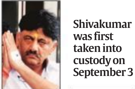
Shivakumar was first taken into custody on September 3

The judge, in his order, wrote that even though police custody cannot be claimed and granted mechanically, it is also true that the investigating agency has to be given a chance for a free, fair and full investigation. "The pace of in-