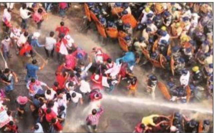
Police use water cannons on protesters during a rally of the Left Front to the state secretariat demanding jobs, in Howrah on Friday.